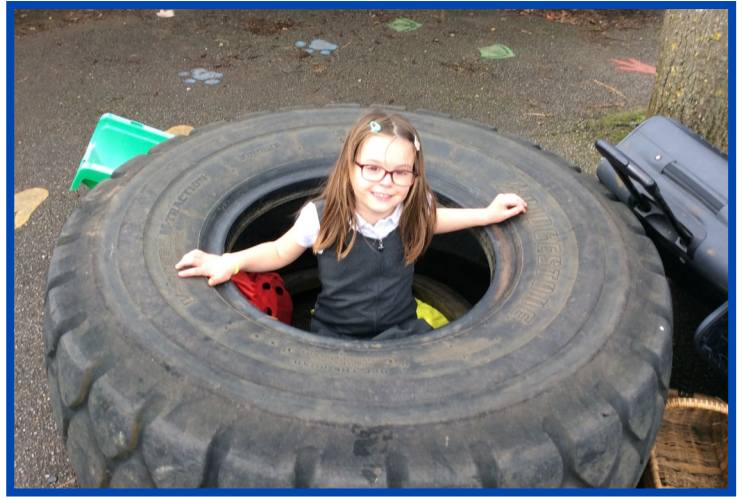
This is what our lunch times look like in the Winter...